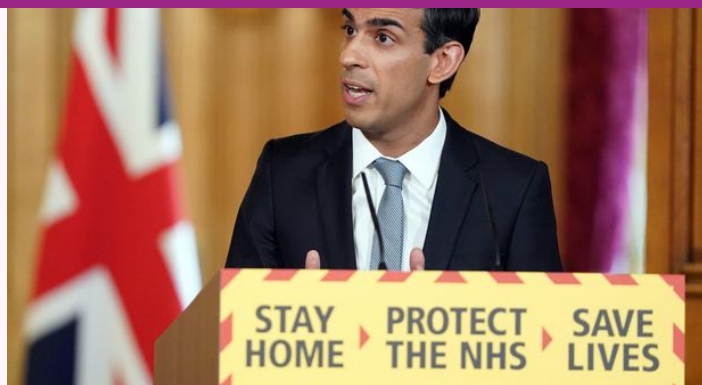
👉 Furlough scheme 'to be extended until March' by Rishi Sunak