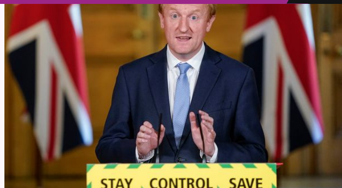
👉 The three things which will re-open first after second lockdown ends